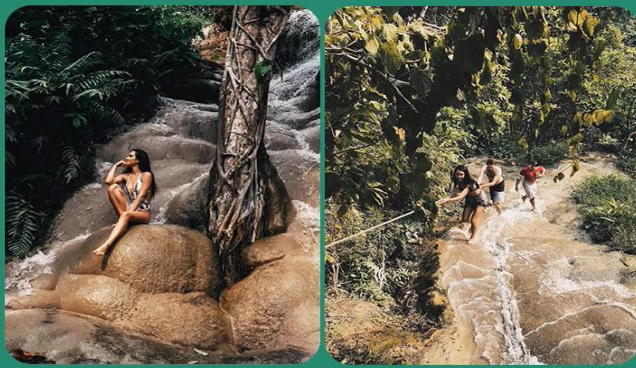
New punching mecca: Bua Thong Waterfall

Visitors can enjoy a unique rock climbing experience at Sticky Falls, where they can climb up the cascading tiers of the waterfall and swim in the natural pools formed by the flowing water.